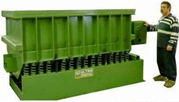
MODEL OHD 4080S 52 CU. FT. CAPACITY With TUB DIVIDERS