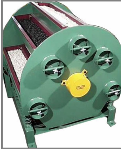
SIDE VIEW OF MODEL MT-5 SHOWS DISCHARGE DOOR FOR EACH OF THE FIVE TUBS. MEDIA AND PARTS CAN BE EXTERNALLY SEPARATED USING MODEL S-1248 SEPARATOR SCREEN (NOT SHOWN).