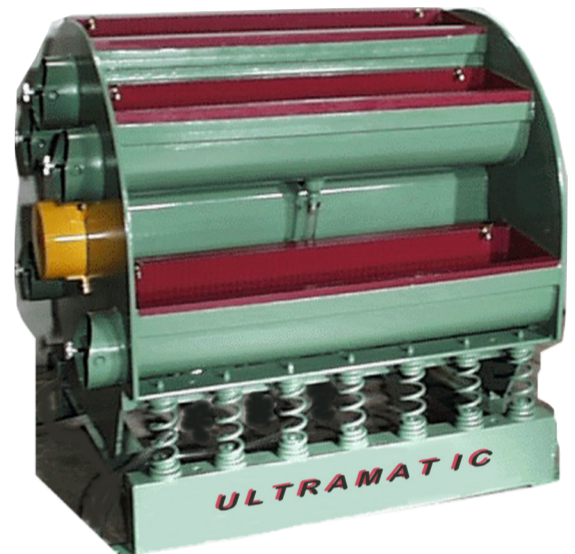
Model MT-5 Five Tub Design

The New MT SERIES (patent# 5803233) by UltraMatic is the most unique innovation in the vibratory finishing industry. The MT features up to five tubs ON ONE DRIVE enabling the user to run multiple processes e.g ; (deburr, wash, burnish, descale, and dry) all simultaneously!! The MT will run any media including heavy steel media yet is flexible enough to run 96" long aluminum aircraft parts with critical tolerances. The requirement to purchase several machines to keep different part types separated is gone. Now you can purchase one MT machine with five tubs for the price of one and minimize the moving parts (motors, belts, bearings, etc.) that are required with multiple machines. Increase productivity by adding our MT series to your finishing department.