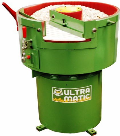
MODEL SVB 3.5

Most Economical Bowl Machine on the Market. 110 Volt on off Switch, Built in Parts Unload System, Solution Pump and Tank available.