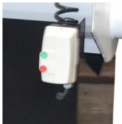
Manual Starter with Overload Protection