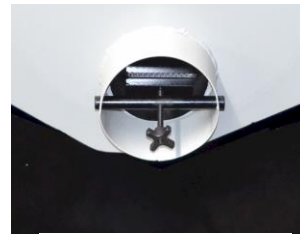
Plug Door with Quick Lock