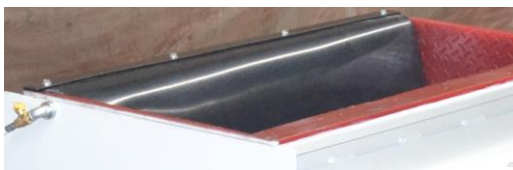
Tub Cover Flap