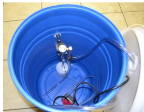
AUTOMATIC PREMIXING COMPOUND SYSTEM (cover removed)