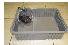
Tank and pump