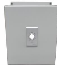
230/460 V CONTROL PANEL WITH TIMER OPTION