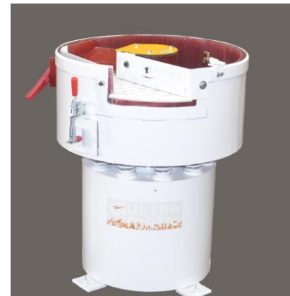
SVB3.5VT with Part Unload, Variable Speed Drive, Timer Switch with corded plug Included with Machine