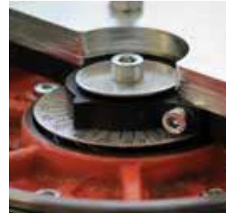
Adjustable Flywheels and Weights

110v VFD PACKAGE includes Variable Speed Drive, Timer, pump receptacle with Corded Plug mounted on a stand.