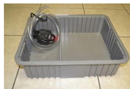
7 gal tank with baffle and pump