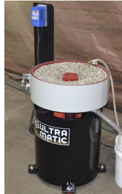
VB1 with Variable Speed Drive, On Off Timer Switch with corded plug Included with Machine