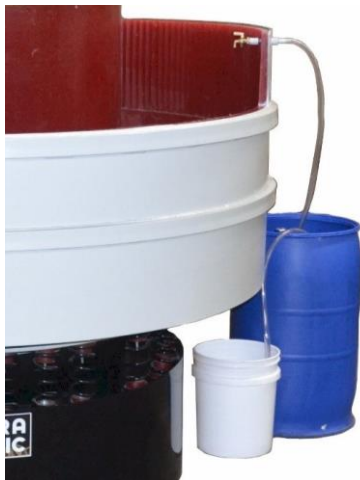
Optional Auto Premix Compound System