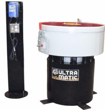
VB with Variable Speed Drive, On Off Timer Switch with corded plug Included with Machine