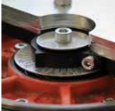
Adjustable Flywheels and Weights

DIRECT DRIVE SERIES ▪ features a Heavy Duty Vibratory Motor with easily adjustable weights. This unique design feature eliminates belts and pulleys and supplies 100 % power to the Tub. Requires 50% less HP resulting in huge electrical operation cost savings.