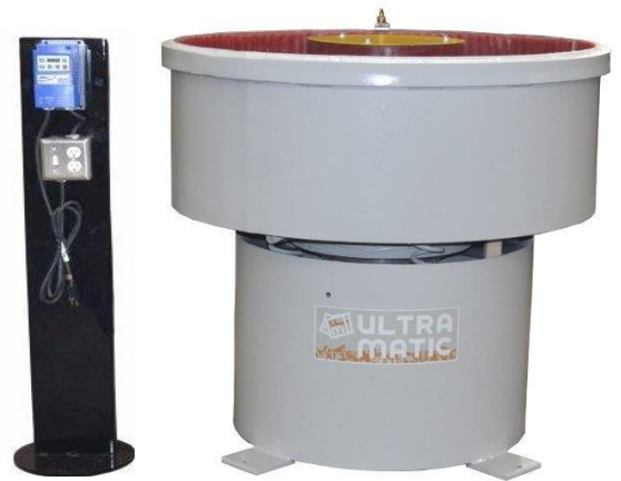
MODEL VB7-VT INCLUDES DIRECT DRIVE, 110V TIMER, VFD