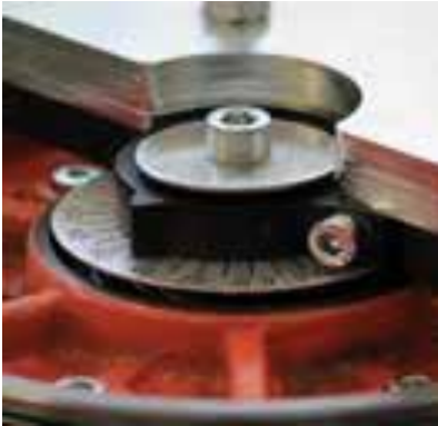
Dial In Adjustable Flywheels and Weights

110v VFD PACKAGE includes Variable Speed Drive, Timer, pump receptacle with Corded Plug mounted on a stand.